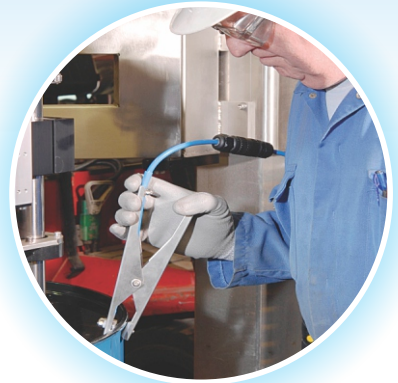
Universal grounding clamp with Quick Connect included