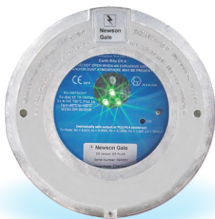
Pulsing LEDs confirm positive ground condition

For more Earth-Rite PLUS grounding applications contact Newson Gale or log on to our website to request a free copy of the Grounding & Bonding Applications Handbook.