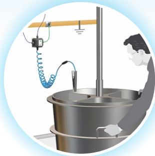
Mixing and Blending