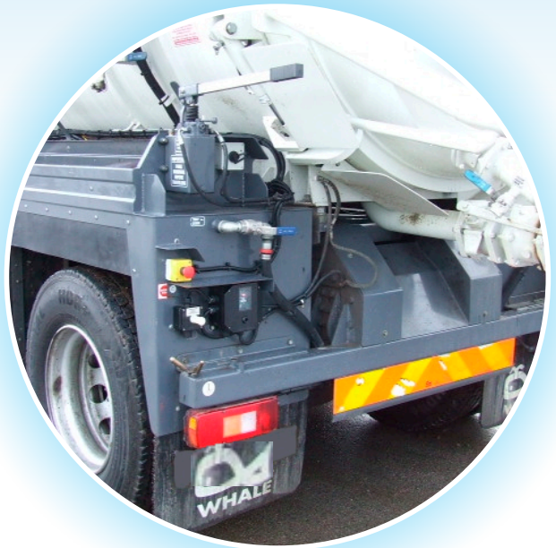
The Earth-Rite MGV static grounding system can be mounted on vacuum trucks and tank trucks.

To eliminate the risk of incendive static spark discharges the API standard 2219: Safe Operation of Vacuum Trucks in Petroleum Service recommends that vacuum truck operators transferring flammable and combustible product in hazardous locations must fully ground the truck prior to any other task in the transfer operation by connecting the truck to a "proven ground source". The Earth-Rite MGV is designed to enable operators establish safe grounding of their vehicle in accordance with this standard.