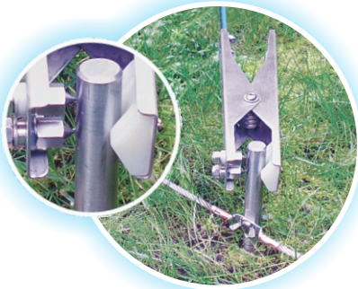
Quick release static grounding clamp supplied with the Earth-Rite MGV attached to buried rod.

When the Static Ground Verification and Continuous Ground Loop Monitoring checks are positive, a cluster of attention grabbing green LEDs pulse continuously informing the operator that the truck is securely grounded.