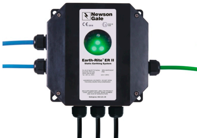
The Earth-Rite MGV static grounding system enables operators demonstrate compliance with the API 2219 standard.